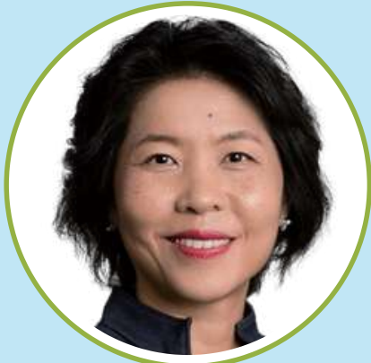
Spokesperson UNHCR Regional Office South-East Asia