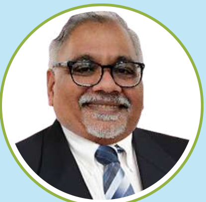
Country Director World Food Program Philippines

I would like to commend Humanitarian Affairs Asia for taking an interest in nurturing our future leaders as compassionate global citizens by organising such a wonderful symposium on leadership in social change. The Symposium was what the UN is all about and what humanity should be all about- making a difference in the lives of people