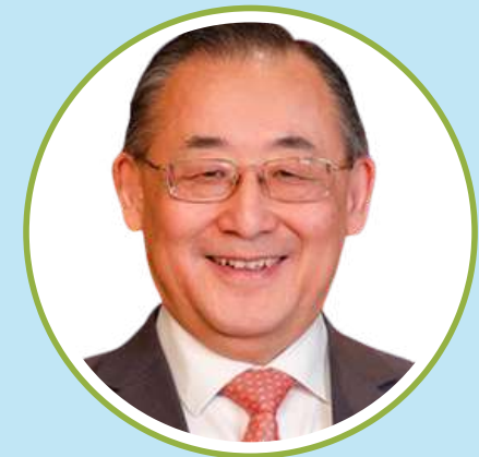
Assistant Director-General UNESCO Paris

Education must equip young people with a new set of skills and competencies for life and work that will allow them to be active citizens in a connected and constantly changing world. Education for the future should train learners to be innovative, adapt to and assimilate change, and continue learning. Thus, I commend Humanitarian Affairs Asia for organising the University Scholars Leadership Symposium to provide a transformative experience for our young leaders.